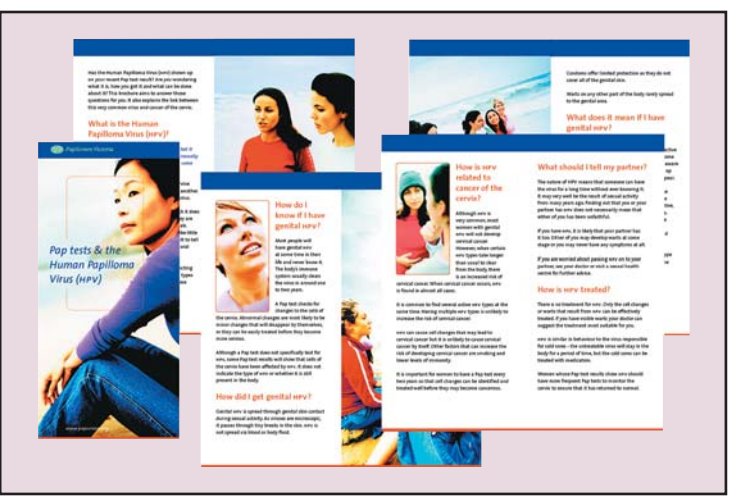
Figure 3. The 'Pap tests and the Human Papillomavirus (HPV)' booklet

risks to humans. In: Vol 64. Human papillomaviruses. Lyon: IARC, 1995.