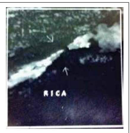
Figure 3. Doppler ultrasound demonstrating a high grade stenosis (80–99%) of the right internal carotid artery (arrows)

Bert also underwent urgent investigation to identify the source of the emboli.