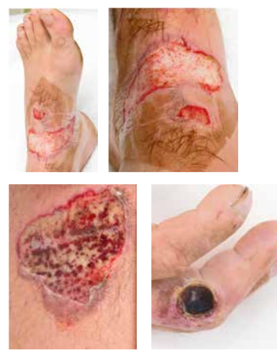
Figure 4. Deep dermal/full thickness burn