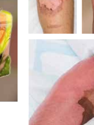
Figure 3. Superficial dermal burn