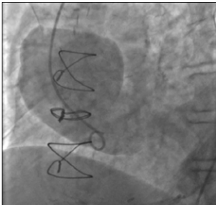
Figure 2. Aortogram showing contrast entering a large false lumen, maximal transverse diameter 8.9 cm