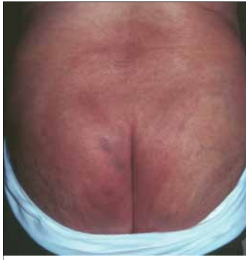
Figure 10. Buttock psoriasis after dithranol treatment

When a rash flares, apply the topical steroid daily, then gradually reduce its use but continue regular application of moisturis