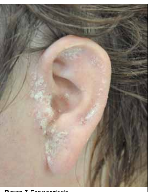
Figure 3. Ear psoriasis

Skin tumours can look psoriasiform. Be suspicious of the isolated plaque of psoriasis that slowly enlarges despite treatment. It may be an in situ