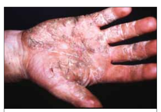
Figure 6. Psoriasis of the palm and fingers

Sometimes there may be a significant degree of uncertainty with the diagnosis. It is not uncommon to see a rash early in its evolution. It may be appropriate to provide treatment and review the situation in a few weeks, with the diagnosis then becoming apparent.