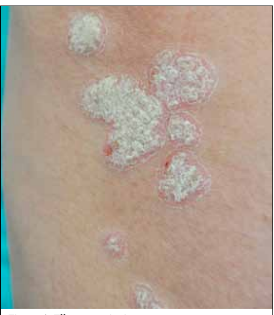
Figure 1. Elbow psoriasis

History and examination are usually all that is needed for a diagnosis. Most experienced practitioners make a diagnosis by pattern recognition.4 Our depth of knowledge and our history taking and observation skills will determine how often we make a confident diagnosis early in the consultation. A guided history and examination will confirm the diagnosis. Beware the pattern that does not quite fit. This is when you need to consider alternative diagnoses.