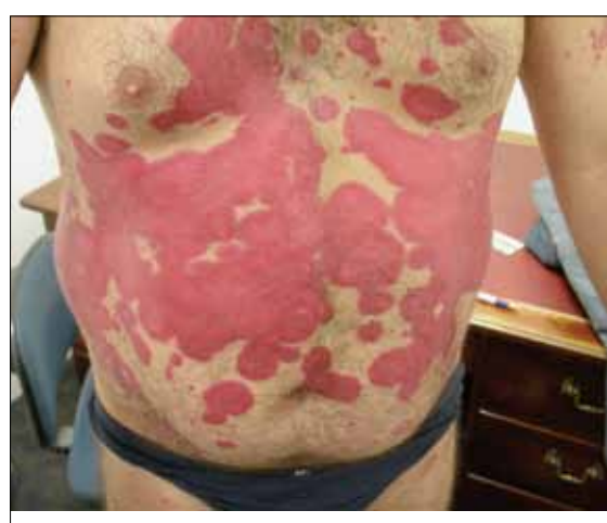
Figure 2. Extensive plaque psoriasis