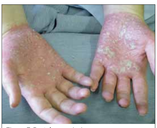
Figure 7. Pustular psoriasis