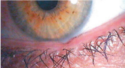
Figure 4. Lower lid notching

caused by chronic infection at the base of the lashes. Without adequate treatment this may lead to ulceration of the lid surface and tissue destruction. Long term complications may include misdirection (trichiasis) or loss of lashes and scarring of the lid margin. Further spread of the infection may lead to chronic styne formation. On observation the lid margin will appear inflamed with small, hard scales surrounding the base of the lashes (collarettes). When removed they may lead to small, bleeding ulcers. Telangiectasia may be seen on close examination