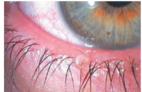
Figure 1. Molluscum contagiosum

Mechanical lid anomalies such as entropion or ectropion (inward or outward turning of the