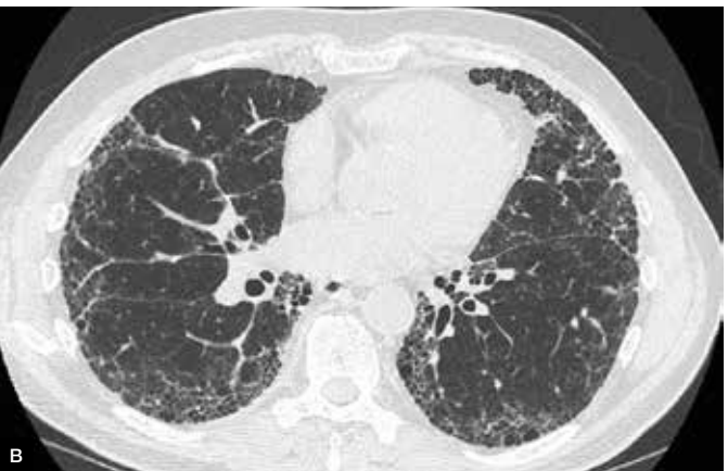
Figure 2. Clinical features in idiopathic pulmonary fibrosis