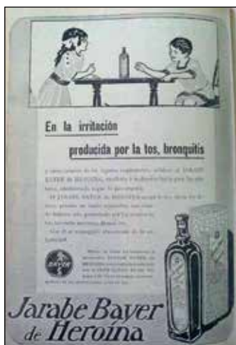
Figure 2. Diacetylmorphine ('heroin') was marketed as an over-the-counter 'non-addictive morphine substitute' for cough suppression from 1898 to 1913 and remains a prescription medicine today in the United Kingdom.

Cannabis, cocaine, nicotine and barbiturates have all variously been marketed as analgesics 1