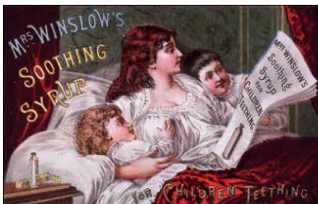
Figure 1. Mid-nineteenth century marketing saw the synthesis of opioids such as morphine, which was sold as a therapy for teething children