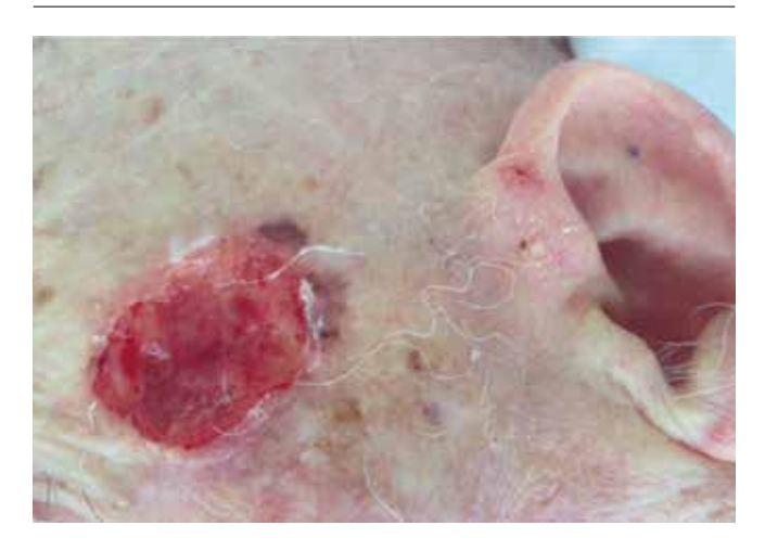
Figure 2. Wound on resident's left temple

A man aged 92 years was referred to CARE-PACT for consideration of intravenous antibiotics for a chronic wound on the left side of his face, which had grown methicillinresistant Staphylococcus aureus (Figure 2). The wound had been first noted after a fall and, despite recurrent courses of antibiotics, there was no resolution of the discharge, nor healing of the wound. The resident was systemically well, had normal vital signs and no fevers. The CARE-PACT emergency physician reviewed a clinical photograph of the wound and, given the apparent raised edge (confirmed on subsequent review) and no evidence of surrounding cellulitis, determined that a more appropriate approach was a punch biopsy to rule out other diagnoses. Punch biopsy, performed in the facility, subsequently confirmed a squamous cell carcinoma and the resident elected to undergo an operative procedure.