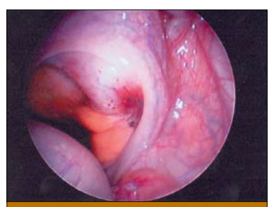
Figure 1. Endometriotic implant right uterosacral ligament (the implant into view from under the ligament). This lesion may be mistaken as superficial on visual appearance alone