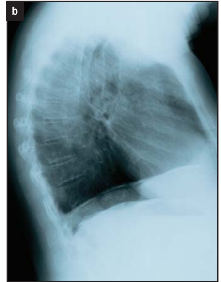
Figure 1a, b.