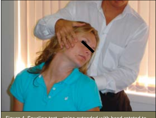
Figure 4. Spurling test – spine extended with head rotated to affected shoulder while axially loaded