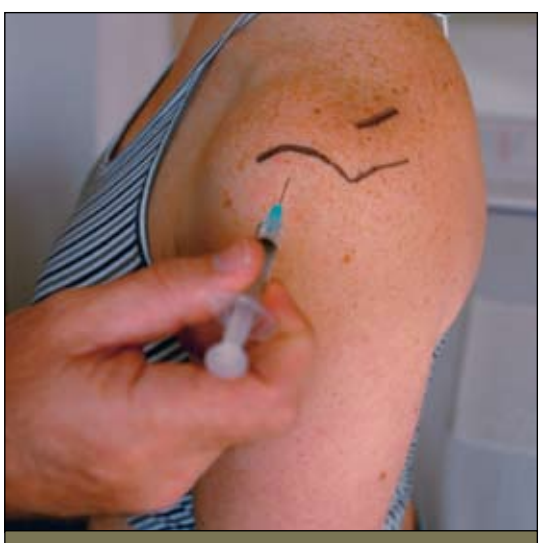
Figure 5. Subacromial space