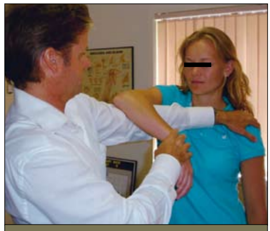
Figure 3. Hawkins impingement test – shoulder placed in 90 degrees of forward flexion and then internally rotated

X-ray is warranted if a bony lesion or advanced arthritis is