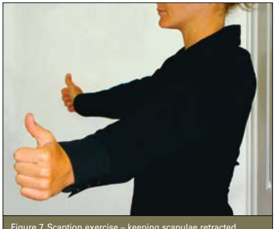
Figure 7. Scaption exercise – keeping scapulae retracted, abduct arms in the scapular plane up to shoulder height