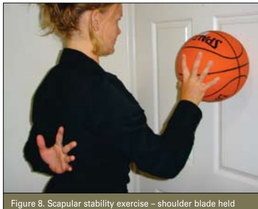
Figure 8. Scapular stability exercise – shoulder blade held down and back (feel its position with opposite hand) as gentle pressure is applied to the ball. Keep the shoulder blade still as the ball is rolled 10 cm up/down and 10 cm in/out