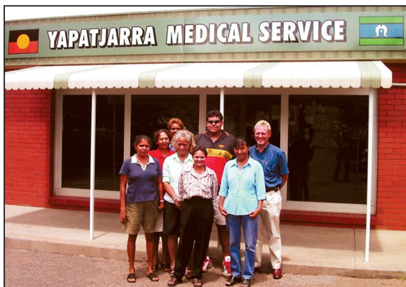
Figure 1. The Yapatjarra Medical Centre

mobile due to the nature of the mining and Indigenous communities.