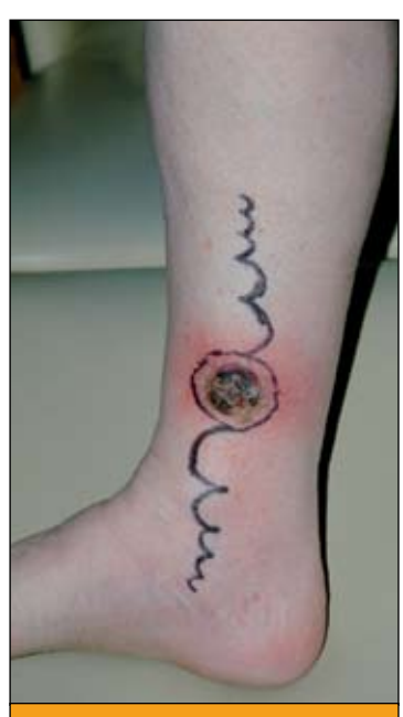
Figure 5. Layout for excision and ROM flap repair

Due to the increased infection risk below the knee, there is an argument for prophylactic antibiotics before surgery in these sites. We recommend 2 g oral dicloxacillin 1 hour before surgery. Above the knee, there are very few indications for antibiotic prophylaxis. Patients at high risk of endocarditis and patients with recent joint prosthetic surgery are special considerations.