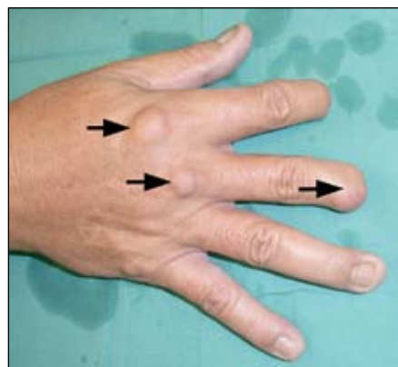
Figure 4. Right hand of Case 4 showing tophaceous deposits in the extensor digitorum communis tendons of the index and middle fingers as well as the stump of the middle finger

At surgery, gouty tophi infiltrating the extensor digitorum communis tendons of the index and middle fingers were excised while preserving the tendons. Histology was consistent with gouty tophi. Wounds healed without delay and movement of the digits were unaffected.