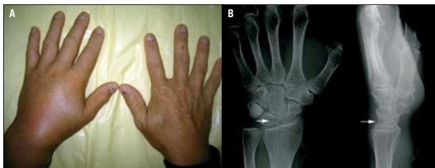
Figure 1a. Both hands showing diffuse swelling and erythema of the dorsum of the left hand and wrist Figure 1b. Plain X-ray of left wrist demonstrating erosion of the posterior surface of the lunate (white arrows)

Septic arthritis with acute carpal tunnel syndrome was suspected. Intravenous antibiotics were started before surgery. At surgery, acute synovitis in the wrist joint and extensor compartments were found, but there was no purulent material. Chalky deposits were found within all the intercarpal ligaments, radiocarpal and midcarpal joints. Erosion of the capitate and lunate were also present. The carpal tunnel was released and the joint washed. Microbiological cultures were negative. Histology was consistent with gout.