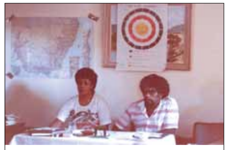
Figure 1. Community activists involved in setting up AMS Redfern

Within a year of opening, AMS Redfern had become so popular it was unable to meet the demand for its services. Federal government funding was made available the following year and since then, AMS Redfern has grown into a multidisciplinary health service, consisting of