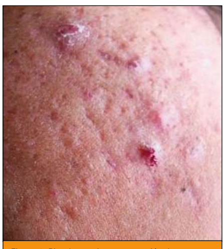
Figure 2. Pitted scars in acne excoriée due to repeated picking