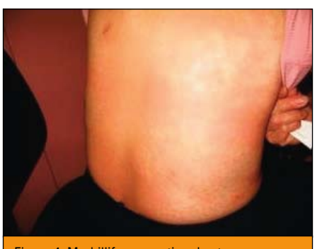
Figure 4. Morbilliform eruption due to

Many psychiatric and neurological diseases may directly lead to skin problems. A notable example is restless legs syndrome wherein the patient experiences unpleasant crawling, creeping, and tingling sensations on the legs accompanied by involuntary kicking, particularly at night. Patients typically describe the sensation as 'insects crawling under the skin'.27 The syndrome may be