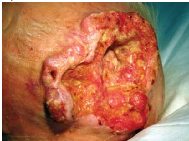
Figure 1. Erosive lesion

Feedback from the surgeon was that neurosurgical assessment would be required and the prognosis was unknown, but most likely