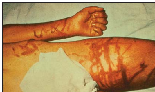
Figure 2. Box jellyfish (Chironex fleckeri) massive envenomation