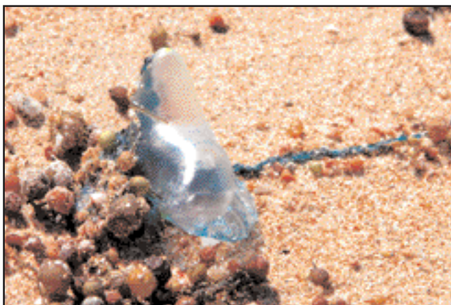
Figure 6. Bluebottle/Portuguese man-o-war Physalia spp.