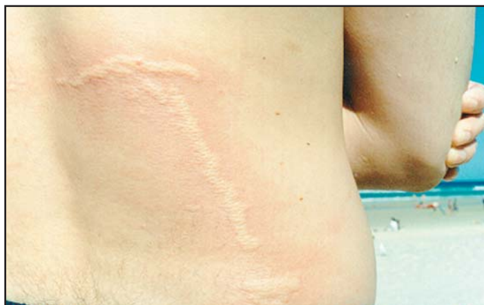
Figure 7. String of beads lesions from bluebottle envenomation