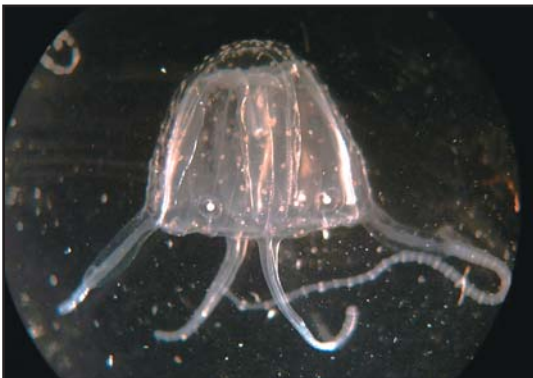
Figure 5. Irukandji jellyfish ( Carukia barnesi )

dose of one ampoule is required if given by the intravenous route or three ampoules are required if given by the intramuscular route.