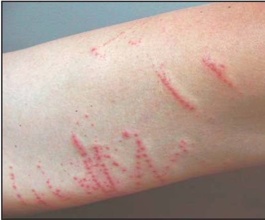
Figure 4. Delayed hypersensitivity reaction