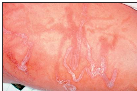
Figure 3. Erythematous lines from box jellyfish tentacle contact

delays basic life support. 6 (This is a controversial area still subject to further study)