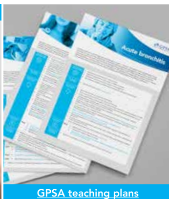
GPSCA teaching plans