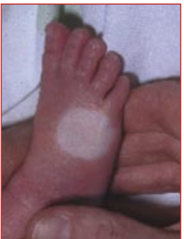
Figure 2b. Release. Colour should return within 2 seconds in the well perfused, warm child