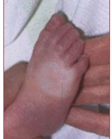
Figure 2c. A delay of more than 2 seconds in association with other signs of shock and in a warm child suggests poor peripheral perfusion

causes for these symptoms. Other causes of these symptoms include: