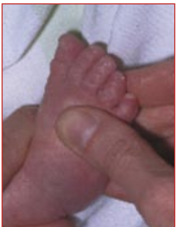
Figure 2a. Press for 5 seconds

Figure 2a-c. Assessment of capillary refill. Reproduced with permission: Advanced Paediatric Life Support 4th ed: instructor materials. Advanced Life Support Group, 2005