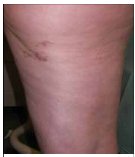
Figure 3. Herpes zoster - S2 dermatome