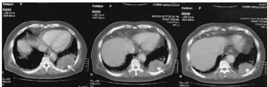
Figure 2. CT scan of the chest showing a solid, well defined, rounded lesion in the left lung posteriorly

( Figure 3b ). The patient was diagnosed with a primary squamous cell carcinoma of the skin (CK5/6 positive) and a lung tumour which was most likely to be a metastasis from the primary skin tumour (T3, N1, M1). 1-3