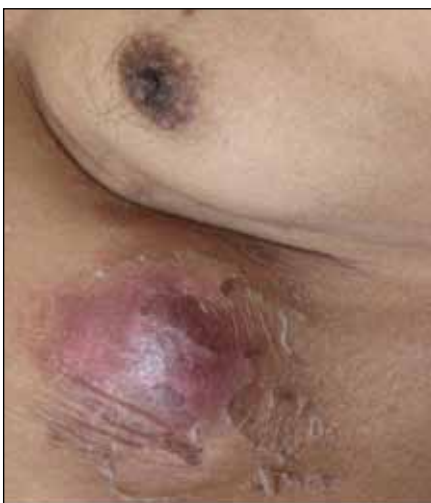
Figure 1. A firm nodular skin swelling in the region of the left upper quadrant

The patient was referred to the emergency department of the local hospital where he had a CT scan of the chest which showed a well defined solid lesion in the left lung which was posterior and peripherally located ( Figure 2 ). An incisional biopsy of the skin lesion showed an ulcerating skin tumour with enlarged vesicular nuclei and occasional mitotic activity, originating from the overlying epidermis with invasion into the underlying stroma and positive staining for CK5/6 ( Figure 3a ). A percutaneous lung biopsy showed tumour cells similar in morphology to those seen in the skin with CK5/6 positivity