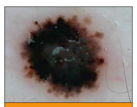
Figure 5. Dermoscopy of cutaneous metastaic melanoma. It has the appearance of malignant melanoma being 'sprayed' on to the site