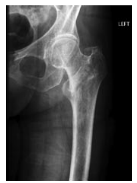
Figure 3. Displaced fracture of the left hip

family. Shoes should have low heels and nonslip soles. Unifocal lenses should be recommended for people who wear spectacles.<sup>11</sup> Use of psychotropic medications and polypharmacy are associated with falls risk.<sup>12</sup> In many cases, the risks of long term psychotropic medications may outweigh their benefits.