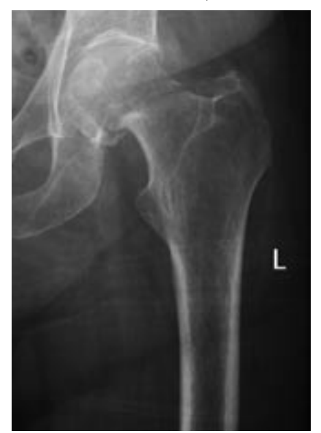
Figure 2. Undisplaced fracture of the left hip

Home hazard modification, including simple measures such as rails and nonslip mats, should be discussed with the patient and their