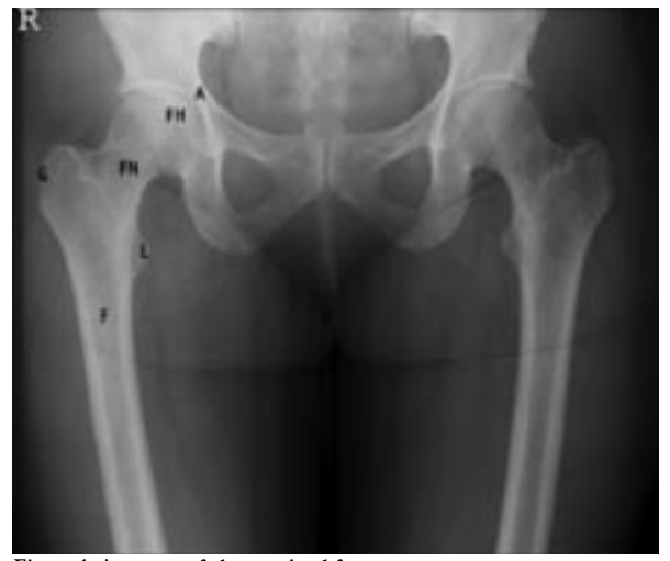
Figure 1. Anatomy of the proximal femur A = acetabulum, FH = femoral head, FN = femoral neck, F = femur, G = greater trochanter, L = lesser trochanter

spinal bone density results. Alternatives to DEXA are available (eg. heel ultrasound), but DEXA remains the most validated and widely used technique.