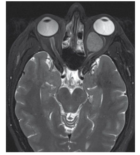
Figure 2. MRI revealed a large retro-orbital mass in a young man with vision loss, orbital pain and proptosis. When this man looked straight ahead his vision was 6/9 in the left eye, but in left gaze the optic nerve was stretched and his vision fell to 6/60. Intraorbital masses may also present with gradual loss of vision if they are not intricately related to the optic nerve in this manner

cortical areas such as motion perception, however dense bilateral loss of vision may result from bilateral occipital lobe infarction and requires urgent imaging and referral to a neurologist.