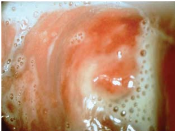
Figure 1. Characteristic white homogenous discharge associated with bacterial vaginosis