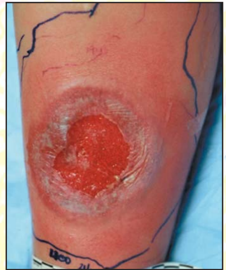
Figure 1. Ulceration of leg

Ms M, a previously well 38 year old woman, presented after noticing the appearance of a papule on the medial side of her right leg that grew over a period of two weeks to form a tender, red, golf ball size mass. As she reported to have fallen from a ladder some time before the appearance of the lesion, the diagnosis of abscess was made and she was treated with penicillin without improvement. In the next fortnight the lesion continued to grow and showed a central area of ulceration. The affected area was exquisitely painful. Figure 1 shows the appearance of the lesion on the day of admission to hospital. The lines on the leg outline the extent of the erythematous, swollen skin. The ulcer grew in diameter from day to day.