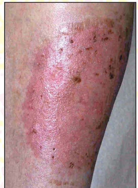
Figure 3. Leg post-treatment

How would you manage this patient? Figure 3 shows the appearance of Ms M's leg after one month of treatment.